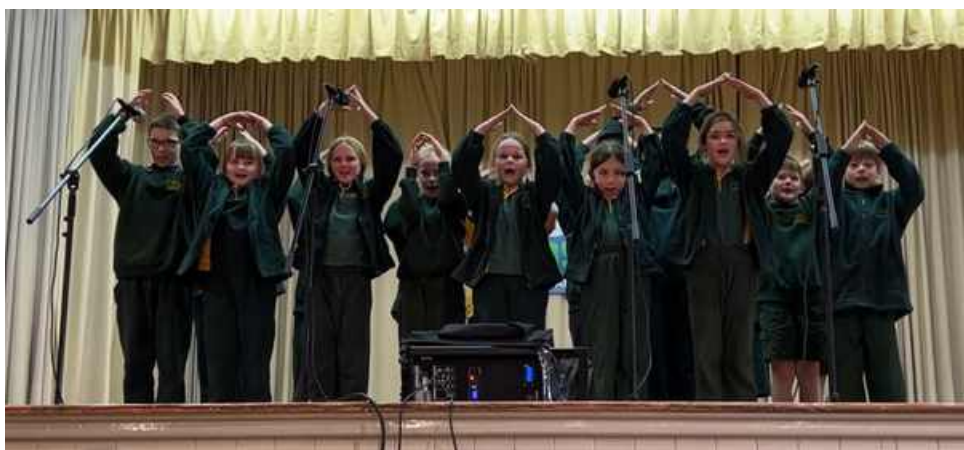
Performing on stage at the Moorabool Kids Big Day Out

Besides all the learning we have been engaged with all year, our students have also had a lovely range of extra activities to keep them interested and motivated to learn.