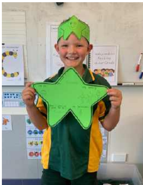
Student of the Week

53347294 warrenheip.ps@education.vic.gov.au