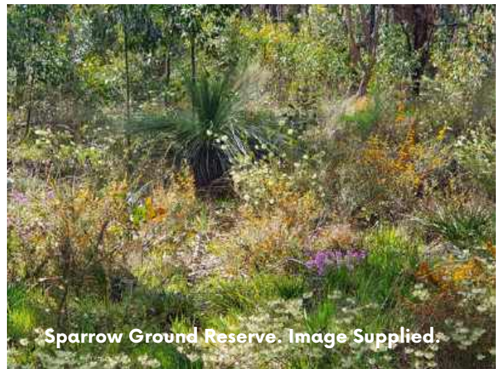
Sparrow Ground Reserve.

We understand that people, including some users of the reserve, have varying views about how the reserve should be managed and used e.g. concerns about fire, preference for a neatly mown park and/or a mindset against the 'messy' bush. Given that these types of views have somewhat hampered the Friends' efforts in caring for the indigenous vegetation, we see the Tours - amongst other