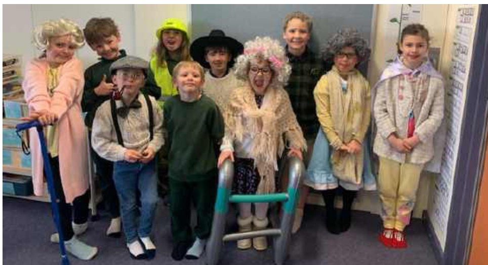
Celebrating 100 days of school for 2024