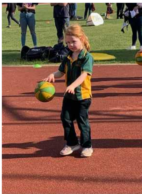
Doing our best at Athletics Day