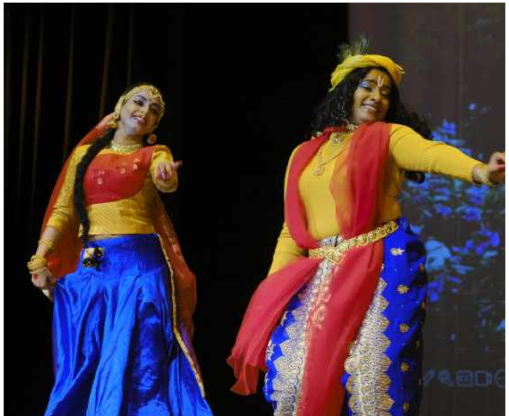
Transwing Dance Studio's performance, "A Krishna-Radha Story".