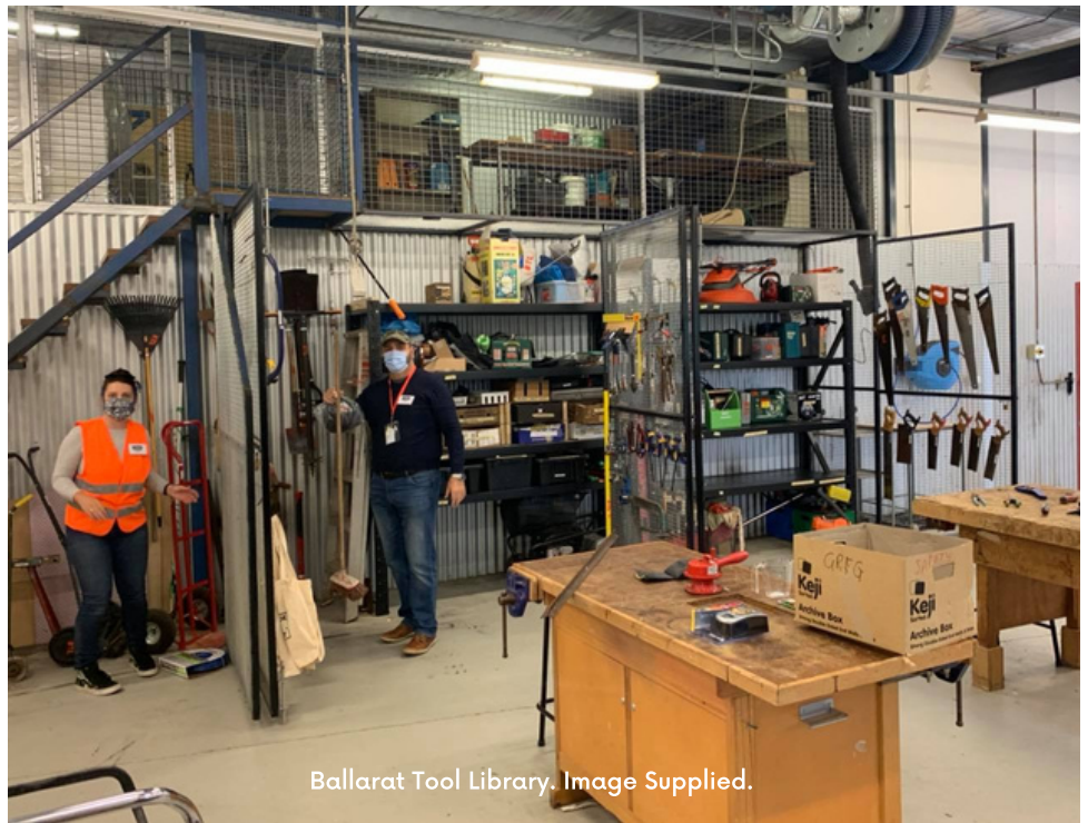
Ballarat Tool Library.

For more information, to register as a volunteer or to send an enquiry about an item, please visit the Repair Café website: repaircafeballarat.com.au . Find us on Facebook and Instagram.