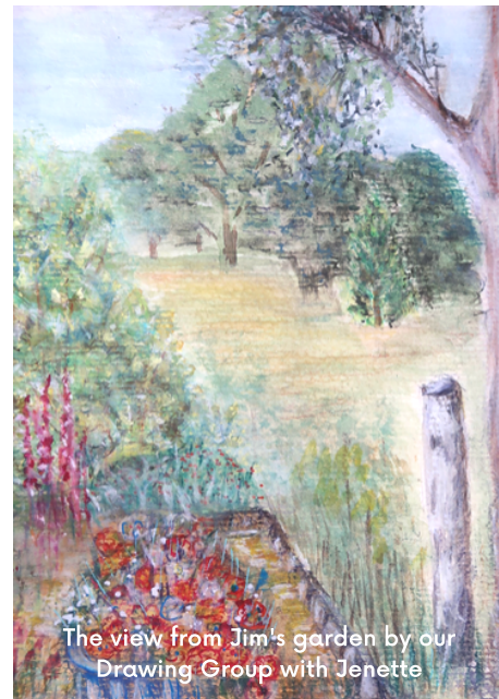
The view from Jim's garden by our Drawing Group with Jenette

Our Heart Foundation Walking Group meets on Mondays from 10.00 am - 11.00 am, starting behind Barkly Square, Ballarat East. Numbers are limited and registration is required.