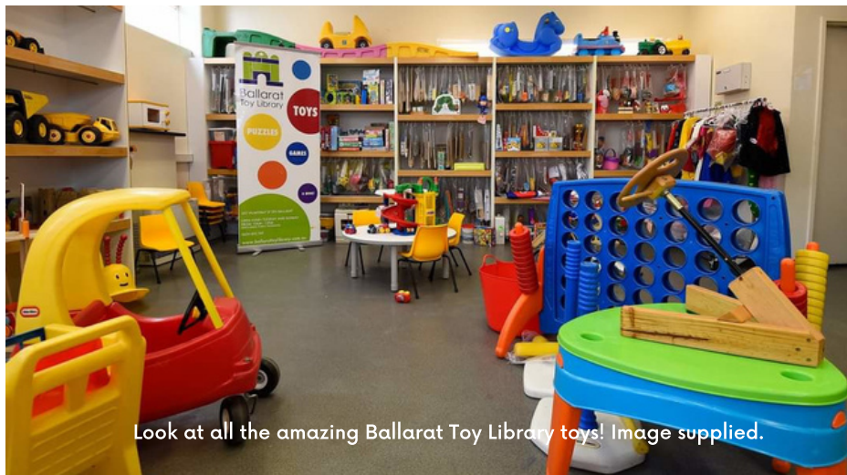
Look at all the amazing Ballarat Toy Library toys! Image supplied.