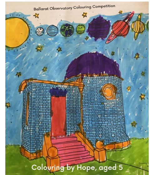
Colouring by Hope, aged 5

Congratulations to everyone who entered our Edition One colouring competition. We had some fantastic colouring of the Mount Pleasant Observatory. The winners have been emailed and a selection of entries can be found on our website: ballarateastnh.org.au/ballarat-east-community-news/ballarat-municipal-observatory-colouring-competition . Prizes were generously donated by the Observatory.