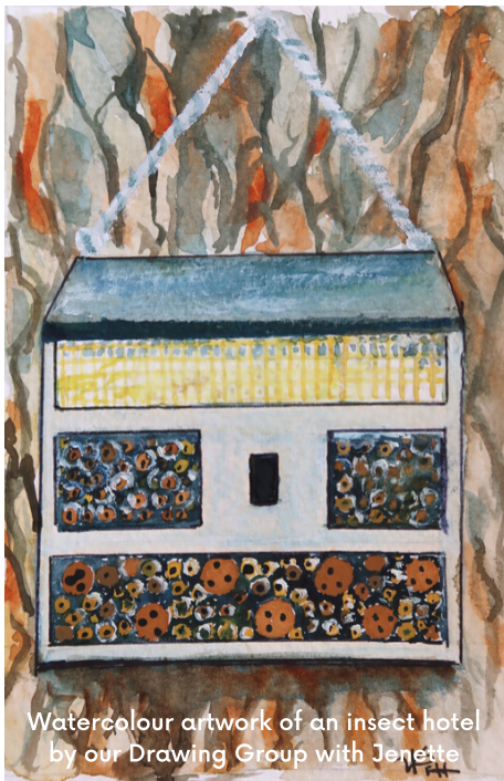
Watercolour artwork of an insect hotel by our Drawing Group with Jenette

Please note that classes must be booked as numbers are limited.